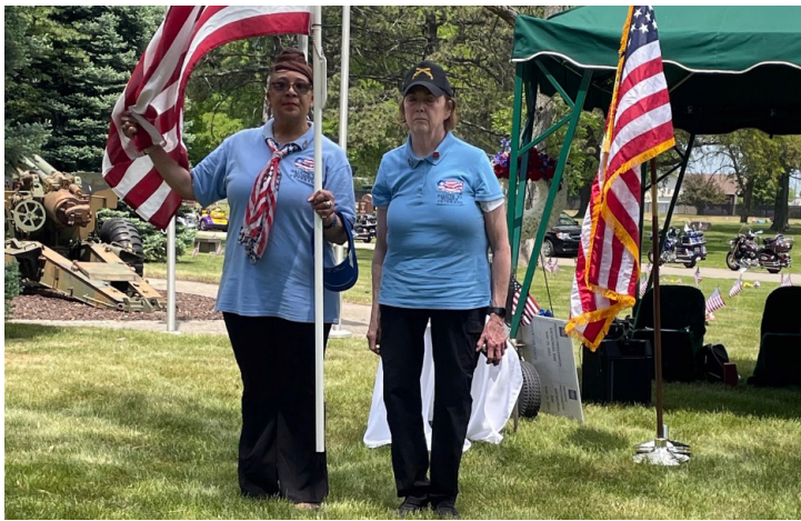
Honoring the fallen.