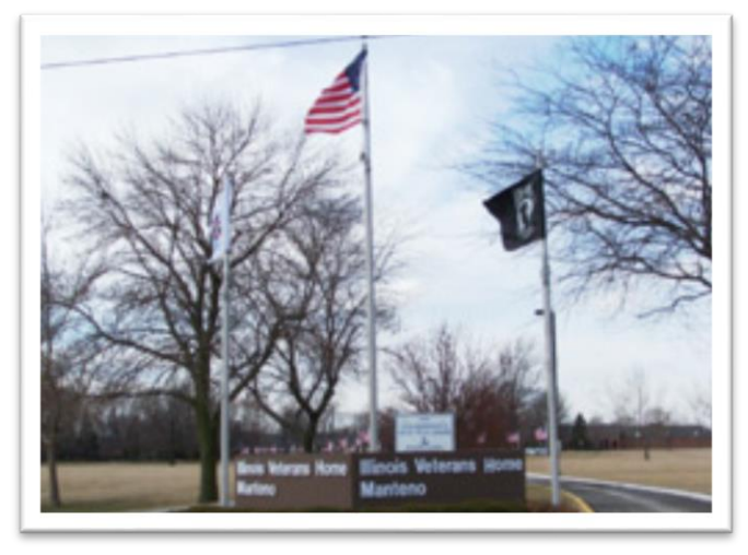
Illinois Veterans' Home - Manteno

The Illinois Veterans' Home at Manteno (IVH-M), which admitted its first resident April 16, 1986, has continued to serve a large number of northern Illinois veterans. The IVH-M is located on a 122-acre campus 60 miles south of Chicago; approximately 143 acres of additional property is farmed with the proceeds of that lease being placed in the Manteno Home Fund. This facility has five nursing care units and two ancillary buildings to provide skilled care to veteran residents. The Home provides a comfortable residence for the veterans in a peaceful rural setting and has a post office, library, bank, beauty/barber shop, and commissary which services up to 294 residents. The campus features a small