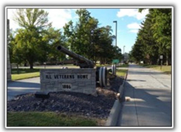
The Illinois Veterans' Home - Quincy

The IVH-Quincy is the largest and oldest veterans' home of the four in Illinois and one of the larger and older