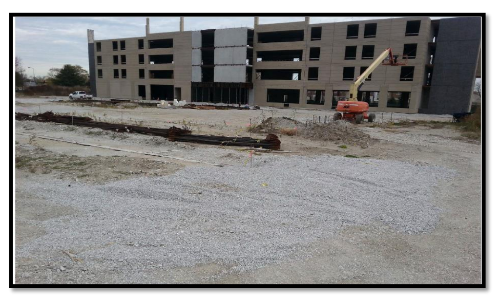
Construction on the Chicago Veterans' Home

Construction is precast concrete with brick veneer. The building consists of five floors with common spaces, administration, and back of the house areas on the first floor. On the second floor of the building are four secure units with roof-top garden outdoor spaces. Twelve additional skilled care units are on the third, fourth, and fifth floors. Each resident room is single occupancy with a private lavatory and roll in shower. Each of the units will have a serving kitchen, dining area, living room, and den. As of July 1, 2015, all state construction projects have had work stopped. Until a capital budget has been signed into law, completion dates for the Home cannot be estimated.