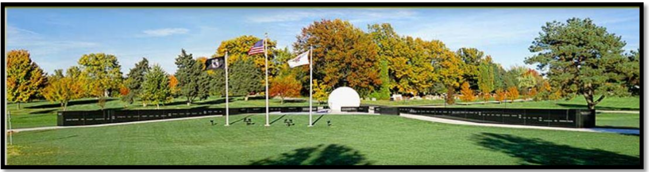
World War II Illinois Veterans Memorial in Springfield, IL

Veterans' needs for services the IDVA provides has increased significantly due to the conflicts in Iraq and Afghanistan resulting in a new influx of returning veterans. The Department's investment in VSOs continues to realize increased federal dollars in annual benefits for Illinois veterans.