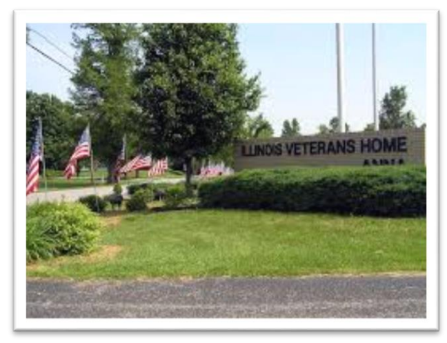
Illinois Veterans' Home - Anna

The Illinois Veterans' Home at Anna (IVH-Anna) is a 50-bed, skilled care nursing facility with six adjoining domiciliary units for 12 residents. Situated on a 16.1-acre site in Union County, the Home provides long-term skilled nursing care services, rehabilitative, and social services.