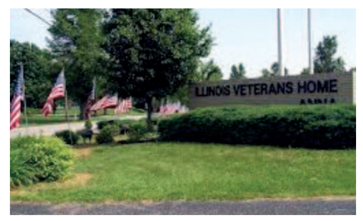
Illinois Veterans' Home in Anna

The Illinois Veterans' Home at Anna (IVH-Anna) is a 50-bed, skilled care nursing facility with six adjoining domiciliary units for 12 residents. Situated on a 16.1-acre site in Union County, the Home provides long-term skilled nursing care services, rehabilitative and social services.