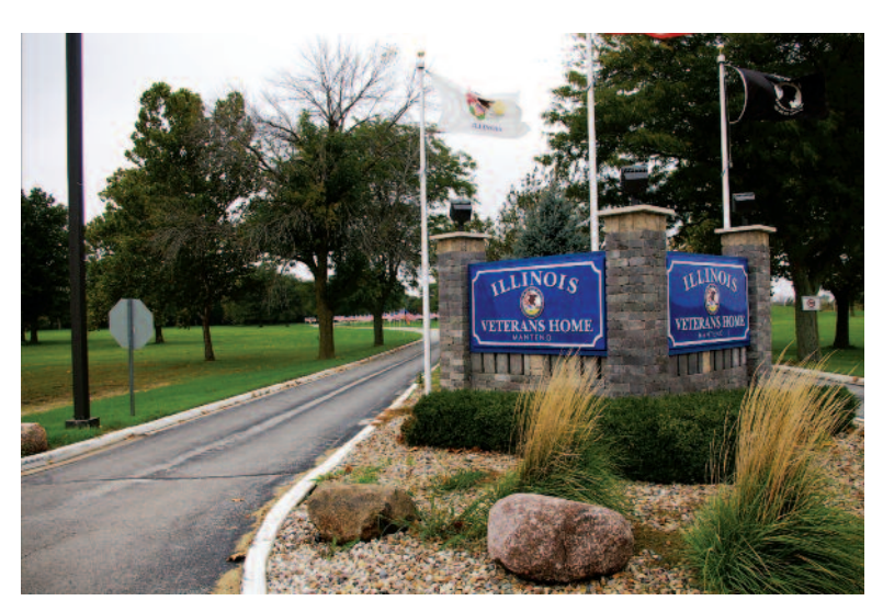
Illinois Veterans Home in Manteno

The Illinois Veterans' Home at Manteno (IVH-M), celebrated its 30th year of service in April and has continued to serve a large number of northern Illinois veterans. The IVH-M is located on a 122-acre campus 60 miles south of Chicago; approximately 143 acres of additional property is farmed with the proceeds of that lease being placed in the Manteno Home Fund. The Home provides a comfortable residence for the veterans in a peaceful rural setting and has a post office, library, bank, beauty/barber shop, and commissary which services up to 294 residents. The campus features a 1½ acre man-made pond that is stocked and landscaped, with a pavilion where veterans can enjoy the outdoors and "catchand-release" fishing.