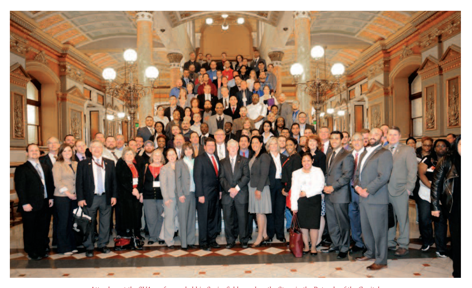
Attendees\ at\ the\ SVA\ conference\ held\ in\ Spring field\ posed\ on\ the\ Steps\ in\ the\ Rotunda\ of\ the\ Capitol.