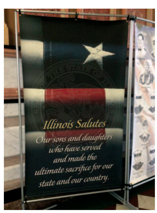
The IDVA displayed 'Portrait of a Soldier' in the rotunda of the State Capitol.

The Grants Division is responsible for all grant accounting functions. This includes managing the processing and awarding of state and federal grants and administration and monitoring of the Vets Cash Scratch-Off Lottery Ticket Program. The division also assists with the design and development of grants and proposals for State, Federal and private sector to acquire funding for veterans' programs, ensuring that requests for federal assistance and grants are submitted to reduce state expenditures