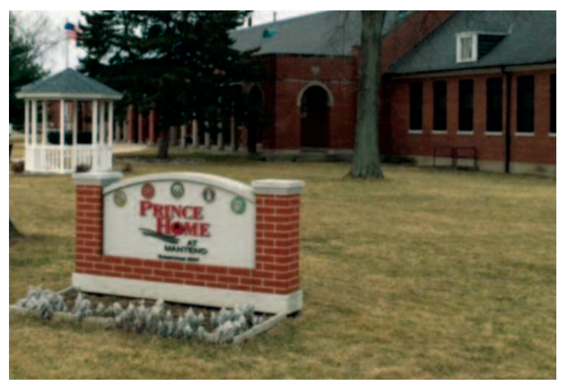
Prince Home for homeless and disabled veterans

Located on the grounds of the Manteno Veterans' Home, the Prince Home for homeless and disabled veterans is a separate program with a dedicated staff and program director. The Prince Home opened in 2007 to provide permanent supportive housing for men and women veterans in its 15-bed facility.