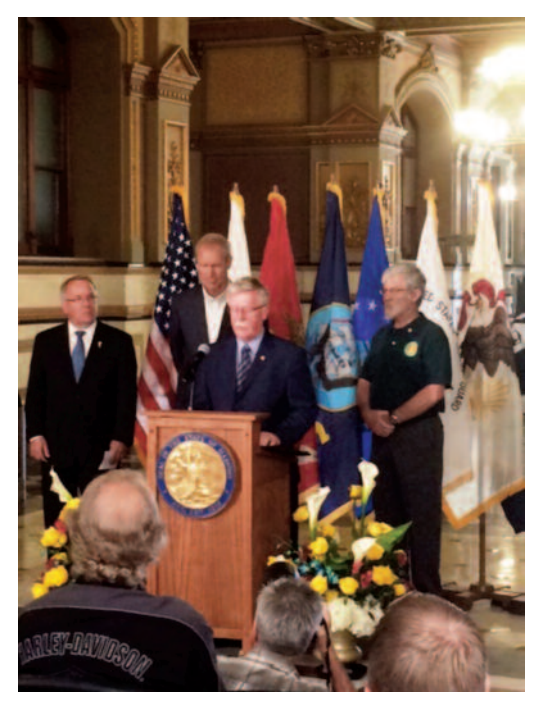
Gold Star family program in Capitol

The Gold Star Families Program works closely with the immediate family of service members lost in combat, assisting them in obtaining their benefits. We serve as the Governor's Office liaison to coordinate and serve Gold Star Families regarding attendance at events held for their benefit and commemoration.