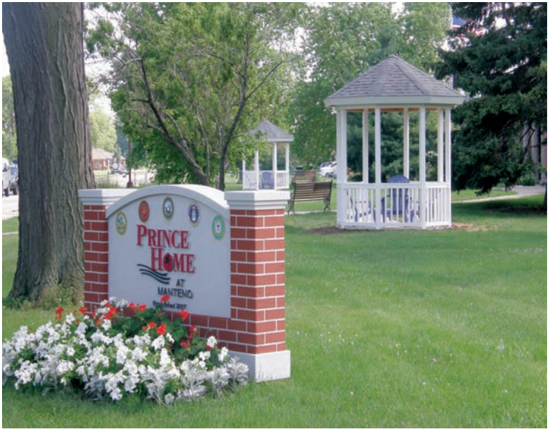
Prince Home for homeless and disabled veterans

Located on the grounds of the Manteno Veterans' Home, the Prince Home for homeless and disabled veterans is a separate program with a dedicated staff and program director. The Program Director at the Prince Home is also the Program Director at the Manteno Veterans Home, due to budget cuts. The Prince Home opened in 2007 to provide permanent supportive housing for men and women veterans in its 15-bed facility.