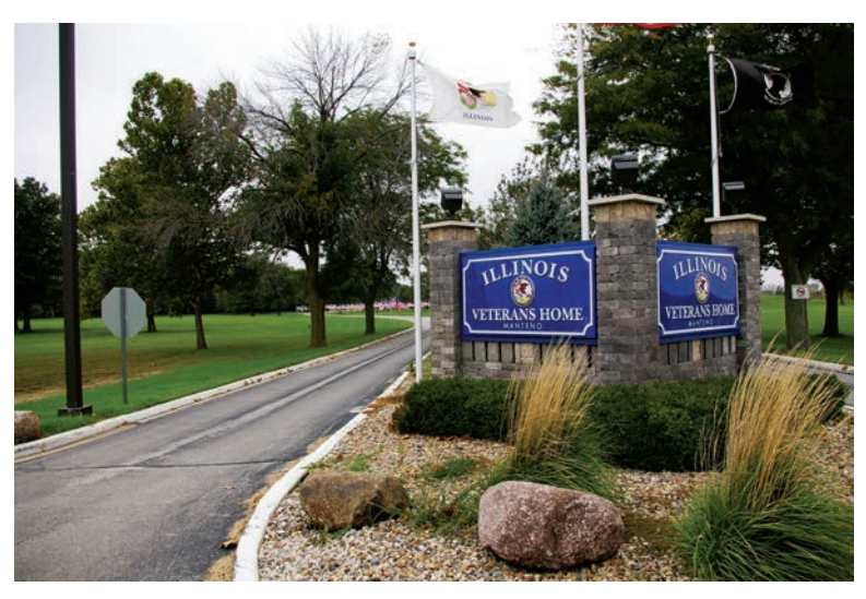
Illinois Veterans Home in Manteno

The Illinois Veterans' Home at Manteno (IVH-M), celebrated its 30th year of service in April and has continued to serve a large number of northern Illinois veterans. The IVH-M is located on a 122-acre campus 60 miles south of Chicago; approximately 143 acres of additional property is farmed with the proceeds of that lease being placed in the Manteno Home Fund. The Home provides a comfortable residence for the veterans in a peaceful rural setting and has a post office, library, bank, beauty/barber shop, and commissary which services up to 294 residents. The campus features a 1½ acre man-made pond that is stocked and landscaped, with a pavilion where veterans can enjoy the outdoors and "catchand-release" fishing.