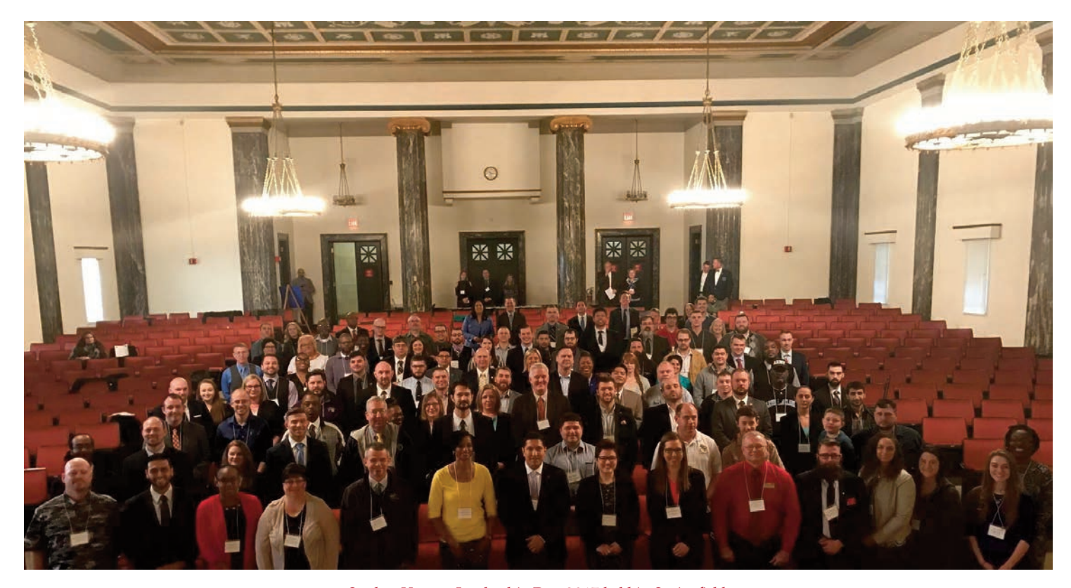
Student Veteran Leadership Day 2017 held in Springfield.