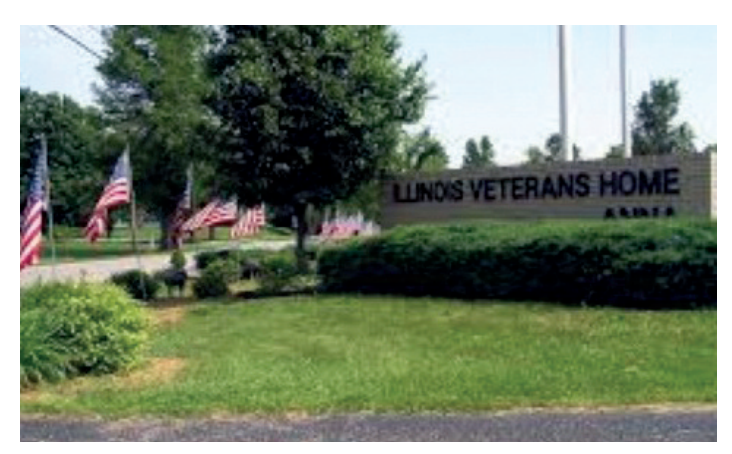
Illinois Veterans' Home in Anna

The Illinois Veterans' Home at Anna (IVH-Anna) is a 50-bed, skilled care nursing facility with six adjoining domiciliary units for 12 residents. Situated on a 16.1-acre site in Union County, the Home provides long-term skilled nursing care services, rehabilitative, and social services.