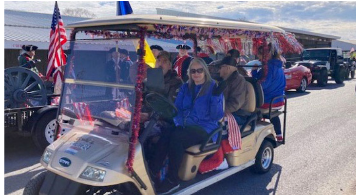
Veterans' Home at Anna