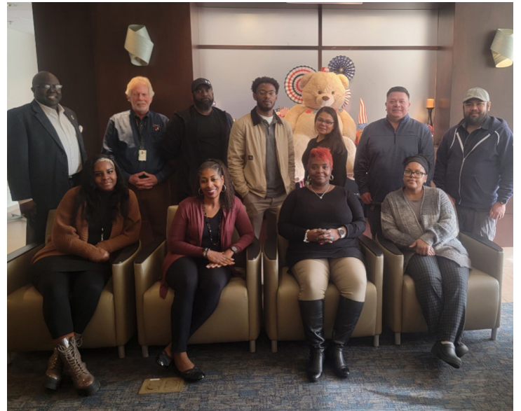
IDVA VSO Team Metro met at the Veterans' Home at Chicago for a Metro/CMC "Region Day." The day included training, a tour of the home, and visit with residents.