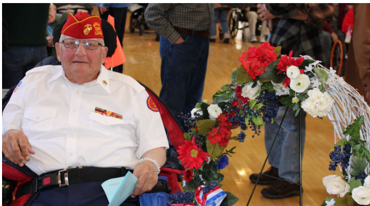
Veterans' Home at Quincy