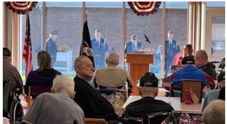
Veterans' Home at LaSalle