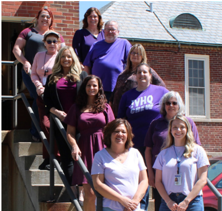
Team Veterans' Home at Quincy