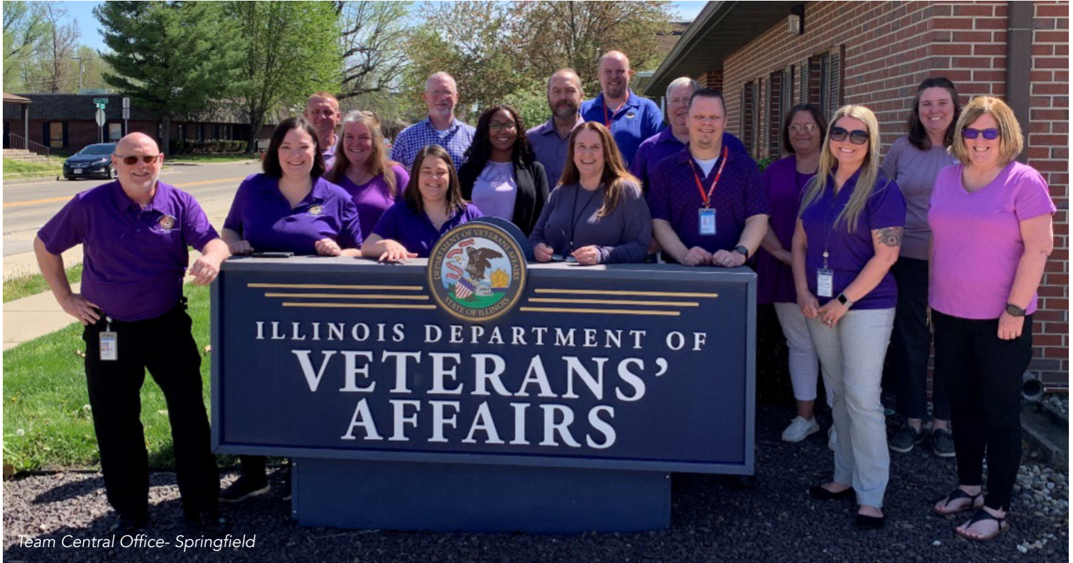
Team Central Office- Springfield

April is the Month of the Military Child where we recognize all the children who support their families through frequent moves, separations, and the challenges of military life. They are strong, resilient, and courageous. IDVA teams across the agency wore purple to demonstrate their support of military children. To all military children around the globe, thank you for your service.