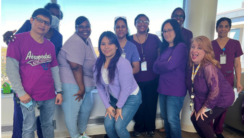
Team Veterans' Home at Chicago