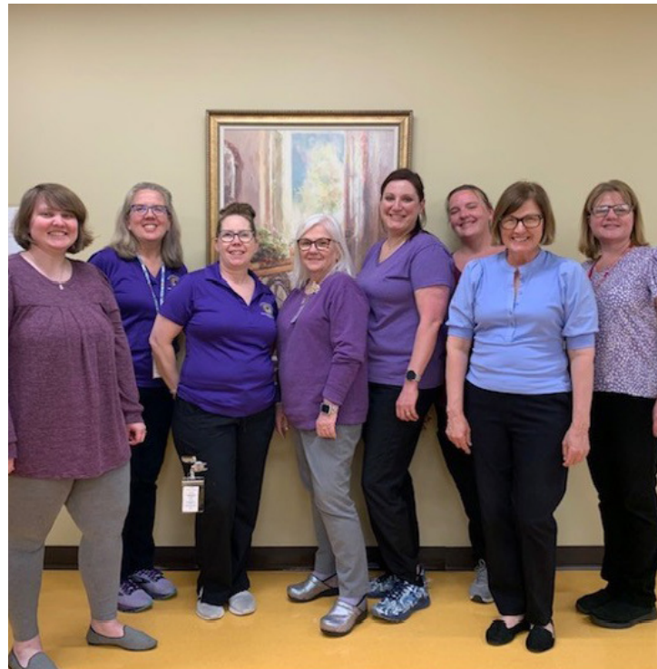
Team Veterans' Home at Manteno