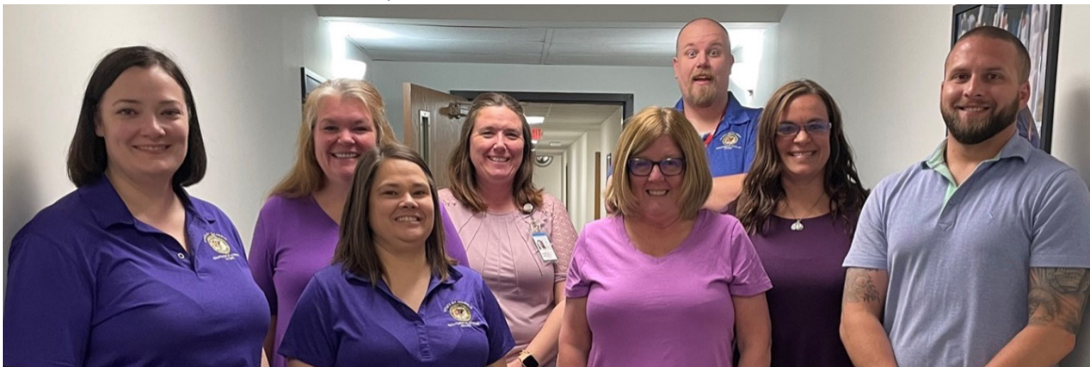
Team Central Fiscal Office