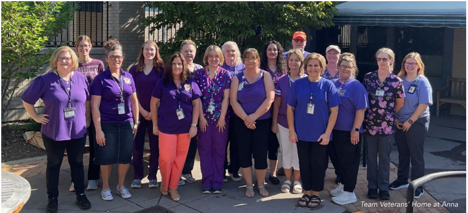
Team Veterans' Home at Anna