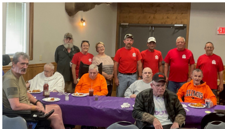
The Elks stay closely connected with veterans at the Anna Home by serving a monthly fish fry, enjoying Bingo, and providing snacks and comfort items.