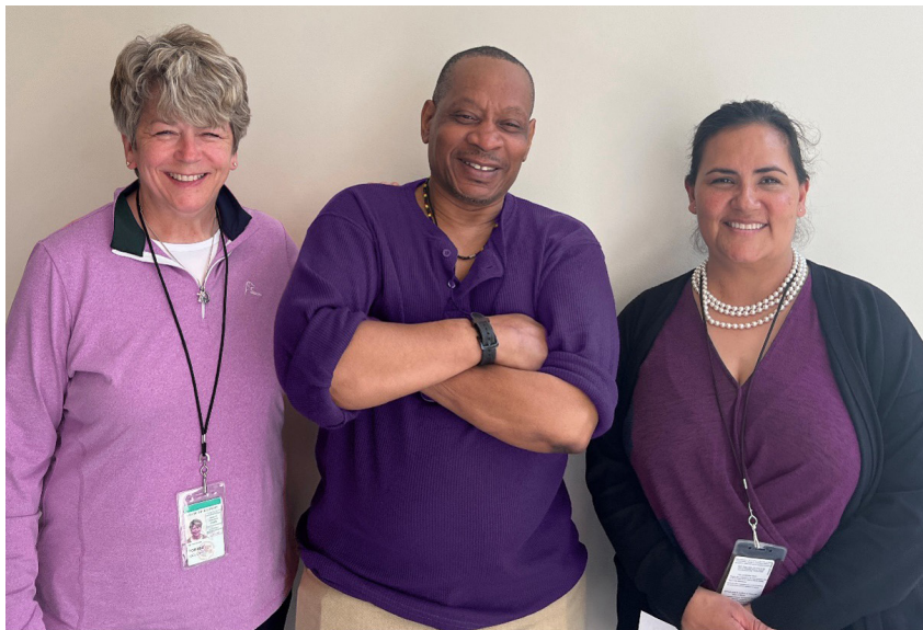
Team Veterans' Home at Chicago