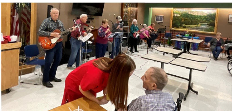
The LZ Group entertains the residents with old time country, rock and roll, and Southern Gospel music at their monthly birthday parties.