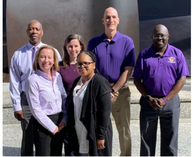
Team Central Office - Chicago