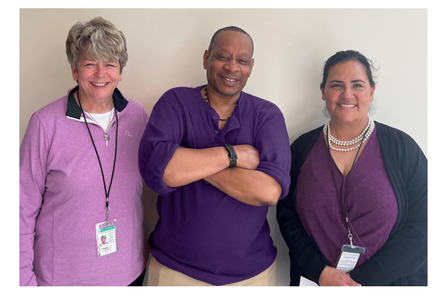
Team Veterans' Home at Chicago