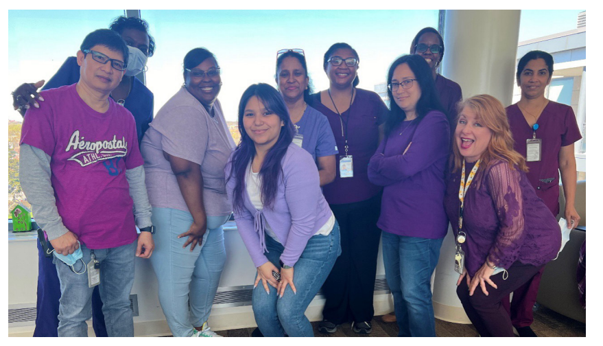
Team Veterans' Home at Chicago