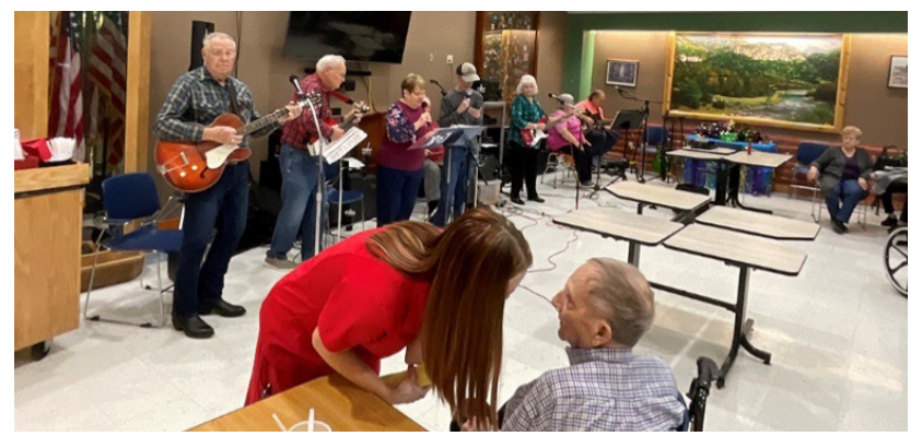
The LZ Group entertains the residents with old time country, rock and roll, and Southern Gospel music at their monthly birthday parties.