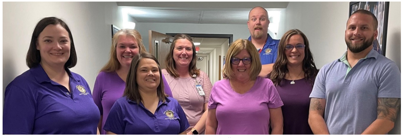
Team Central Fiscal Office