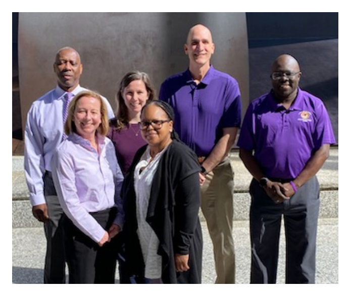
Team Central Office - Chicago