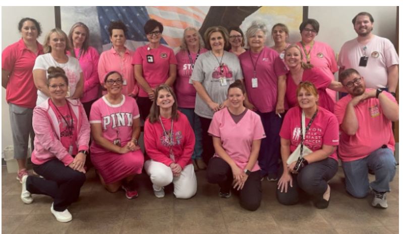
Veterans' Home at Anna