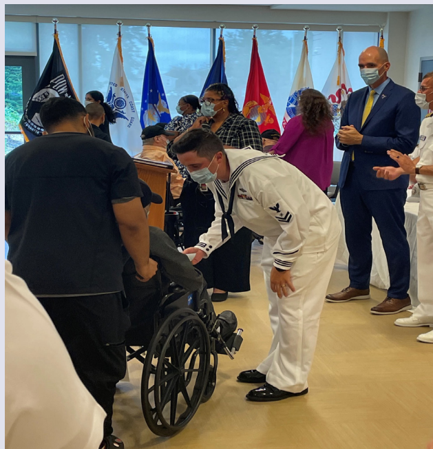
Sailors present U.S. Navy veterans with a Vietnam War pin as part of the Vietnam War Commemoration Ceremony.