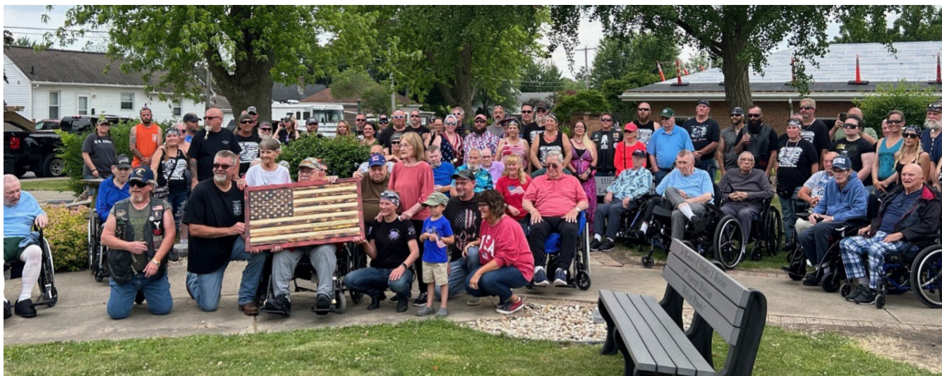
The Veterans' Home at LaSalle unveiled a Vietnam Veterans Memorial in its Peace Garden, accompanied by a motorcycle drive-by of local veterans.