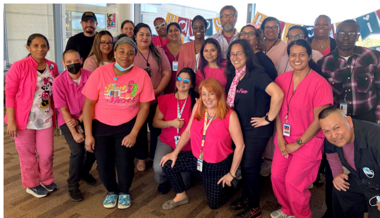
Team Veterans' Home at Chicago wears their pink well!

In honor of the millions of women who have been diagnosed with breast cancer, IDVA staff participated in a department-wide "Pink Out Day" to show support for the women who have or are actively battling breast cancer and the survivors.