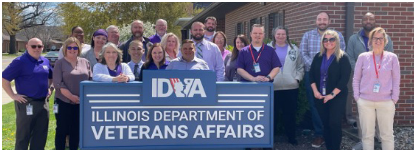
IDVA Central Office recognizes military children for their strength, resilience, and sacrifice by wearing purple on Purple Up Day, April 11, 2025. Purple is a blend of all the colors of the U.S. Military branches.

VSOs are accredited by the US Department of Veterans Affairs (USDVA). They assist veterans and their dependents in filing claims for benefits with state and federal agencies. This assistance includes applications to the USDVA for compensation, pension, and increased disability benefits. Additionally, VSOs assist in applying for admission to the Illinois Veterans' Homes, state and federal education, burial benefits, and federal health benefits. IDVA's accredited Appeals VSOs coordinate directly with the USDVA's Veterans' Benefits Administration to present and represent claims, assist veterans in appealing decisions, and appear at hearings with the claimants before administrative law judges.