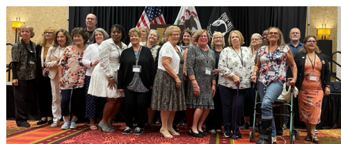
Gold Star Families gather at Gold Star Families Weekend in Bloomington.

Gold Star Families Day is held the last weekend in September and culminates with the Yellow Rose Ceremony on National Gold Star Mother's Day. In FY25, the families gathered in Bloomington for two days of programs, events, and gatherings. The families shared stories and honored their hero through tears and laughter.