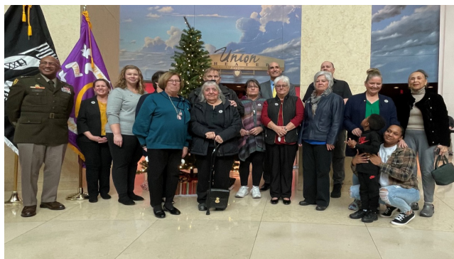
Gold Star Families participate in the Christmas Tree Lighting.