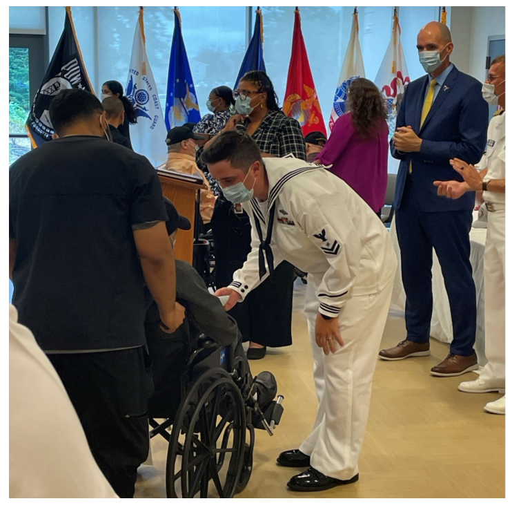
A Vietnam Veteran is pinned by a U.S. Navy Sailor.