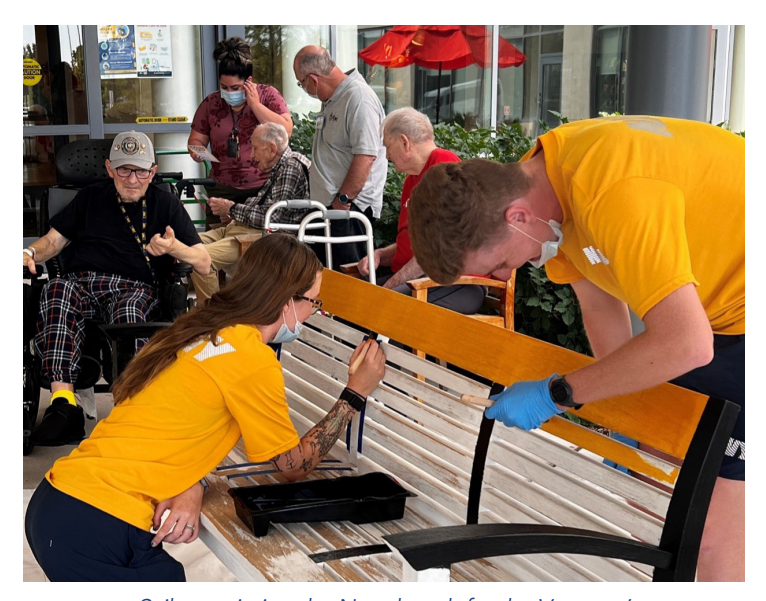
Sailors painting the Navy bench for the Veterans' Home at Chicago's garden.