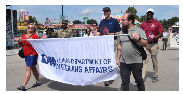
Team IDVA marches in the Springfield State Fair Veterans Day Parade.

This year's theme, "Service Across the Generations," resonated with many veterans who proudly followed in the footsteps of a loved one or paved the way for future generations.