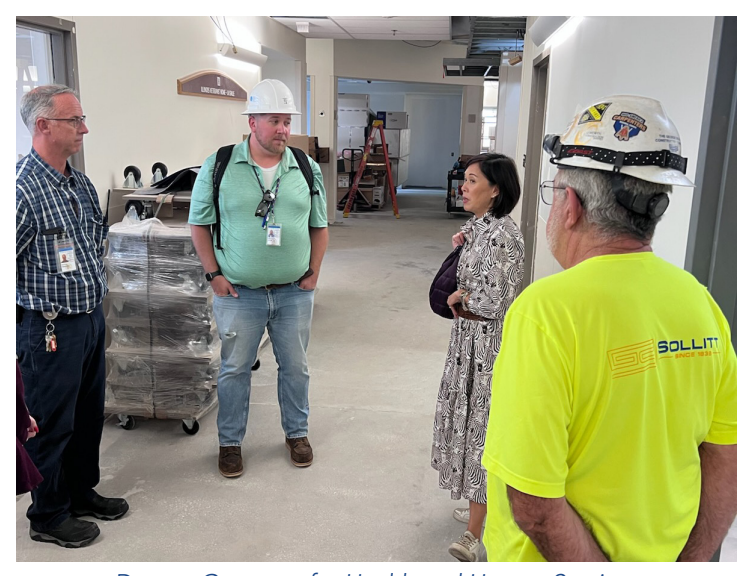
Deputy Governor for Health and Human Services Grace Hou visits the Veterans' Home at LaSalle and tours its ongoing construction project.