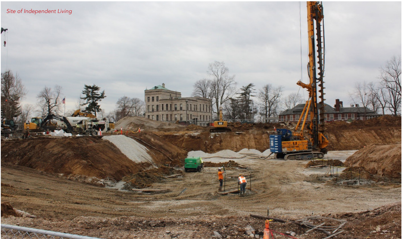
Site of Independent Living

Today, construction is well underway as crews are at work regardless of the climate, and the home has made sure that the resident veterans' lives are not disrupted, and that families and friends are able to visit campus. The Quincy Home's project is set for completion in 2024. Time will fly, and we cannot wait to celebrate the renovated Veterans' Home at Quincy.