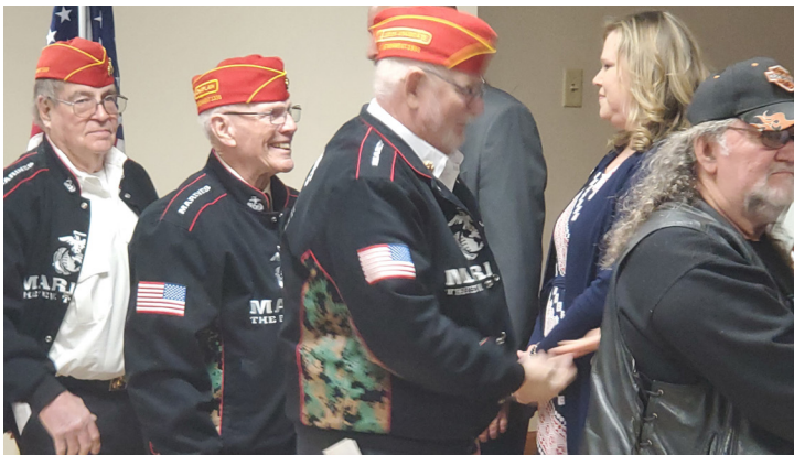
Vietnam Veterans receive their pins honoring their service.

Illinois Department of Veterans' Affairs hosted a pinning ceremony in Lincoln, Illinois. The program is a partnership with IDVA and several veteran organizations in Logan and surrounding counties.