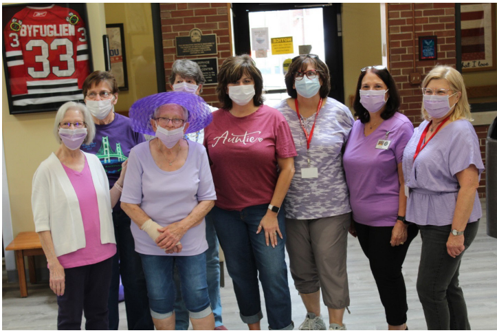
Veterans' Home at Manteno Volunteers