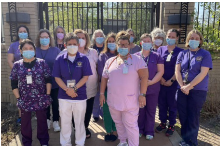
Veterans' Home at Anna