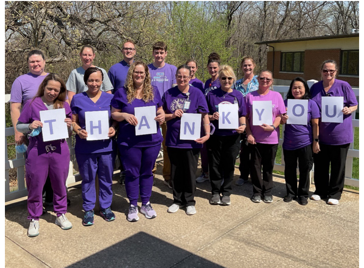
Veterans' Home at Quincy: Fifer Hall