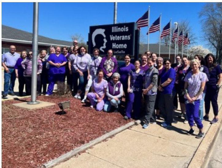
Veterans' Home at LaSalle