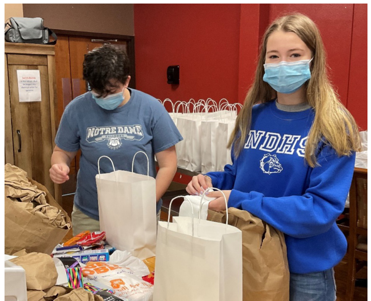
North Dame High School volunteers