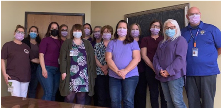
Veterans' Home at Manteno Staff