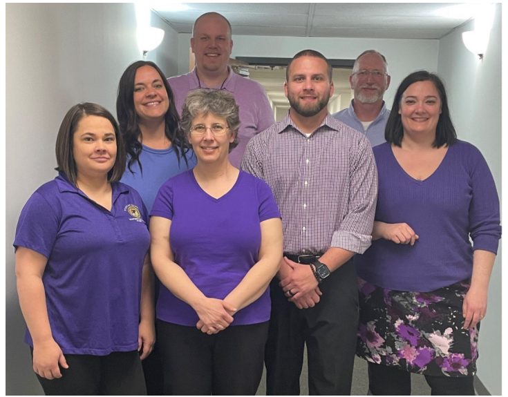
IDVA Central Office: Fiscal Team