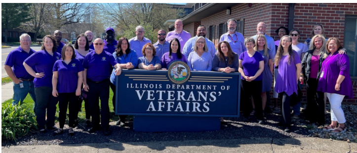
IDVA Central Office