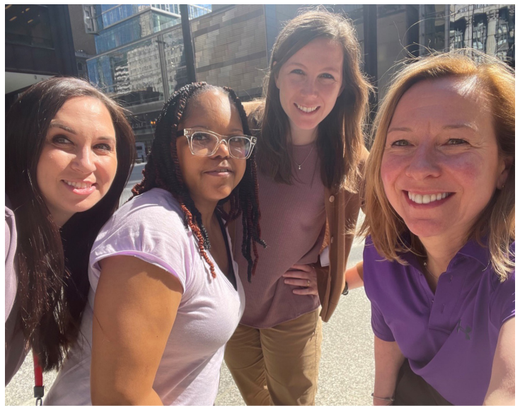
IDVA Chicago Office