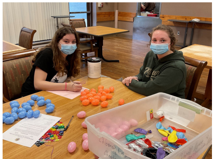
Notre Dame High School students