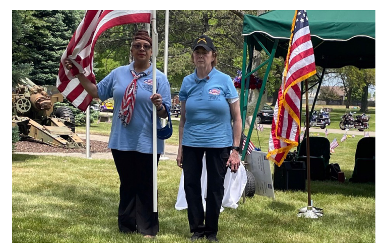
Honoring the fallen.

National Women Veterans United Memorial Day Program was held at the Dignity Memorial Cemetery in Evergreen Park. The National Women Veterans United (NWVU) mission is to advocate, educate and bond with all military women veterans with special emphasis on women who are disabled, homeless, at risk or returning from deployment, to ensure they are connected to appropriate direct services and resources for readjustment and coping skills, as they return to employment, school and family. For more information visit: https://nwvu.org/