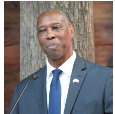
The Guest of Honor and Assistant Director of the IDVA delivers the keynote address.

To view the Commandant's Message, click here: Commandant's message .