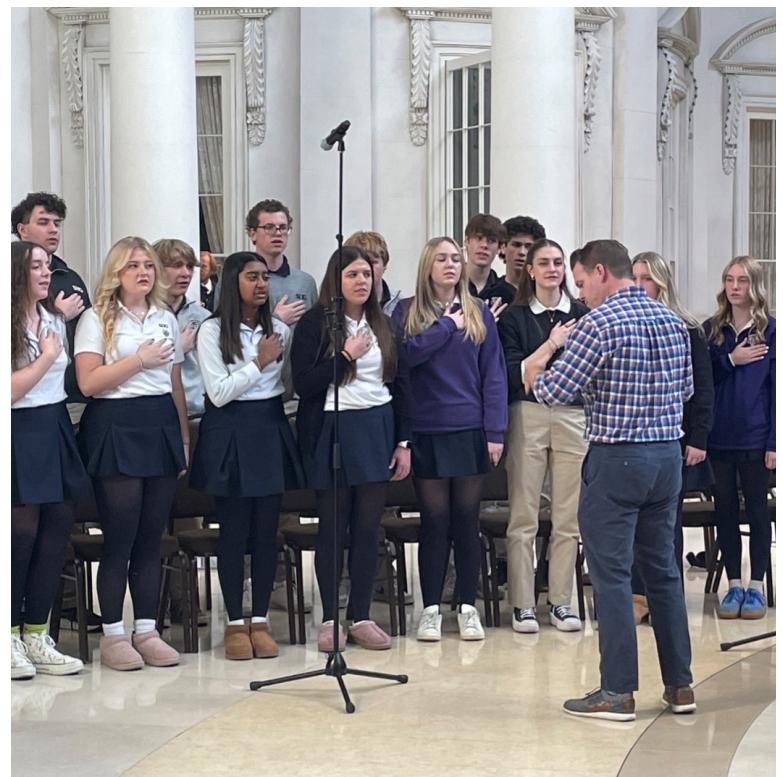
Sacred Heart Griffin Encore Choir performs the National Anthem.