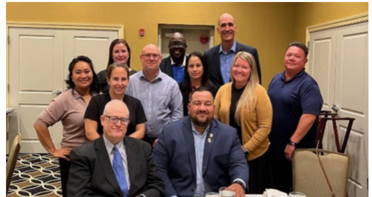
VSOs attend the IACVAC Banquet on September 22, 2022

was informative and complimented the training that we had in the Spring. We are planning additional collaborative training events. Thank you IACVAC leadership and members for the training and hospitality.