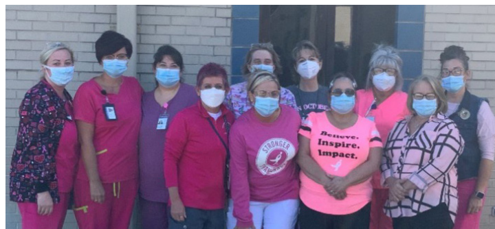
Team IDVA at the Veterans' Home at Anna.