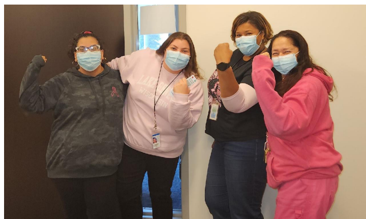
Team IDVA at the Chicago home