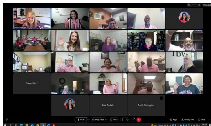
Chicago and Springfield offices show their support of Breast Cancer Awareness Month.

In honor of the millions of women who have been diagnosed with breast cancer, IDVA staff participated in a department-wide "Pink Out Day" to show support for the women across the world who have or are actively battling breast cancer.