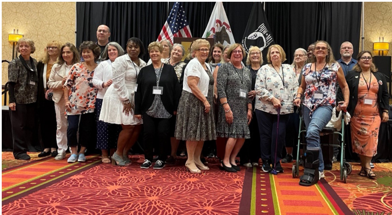
Gold Star families in Bloomington, Illinois.

Gold Star families from across the state joined in Bloomington for the annual weekend of fellowship, events, and programs. It is a weekend to share stories and memories through tears and laughter. The weekend culminated with the Mother's Day luncheon and Yellow Rose Ceremony. For more information on IDVA's Gold Star program, visit: Gold Star Families .