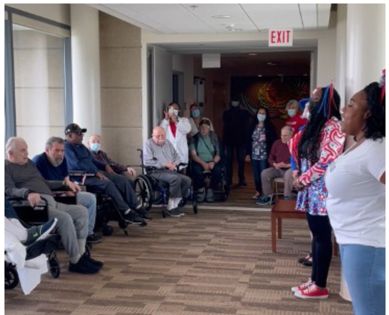
July 4th at the Veterans' Home at Chicago featuring food, music, and entertainment.