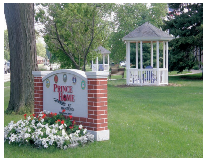
Prince Home for homeless and disabled veterans

Located on the grounds of the Manteno Veterans' Home, the Prince Home for homeless and disabled veterans is a separate program with a dedicated staff and program director. The Prince Home opened in 2007 to provide permanent supportive housing for men and women veterans in its 15-bed facility.