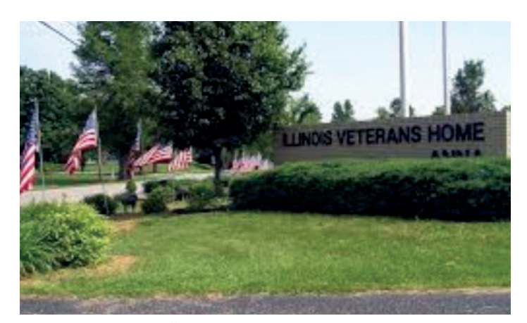
Illinois Veterans' Home in Anna

TThe Illinois Veterans' Home at Anna (IVH-Anna) is a 50-bed, skilled care nursing facility with six adjoining domiciliary units for 12 residents. Situated on a 16.1-acre site in Union County, the Home provides long-term skilled nursing care services, rehabilitative, and social services.