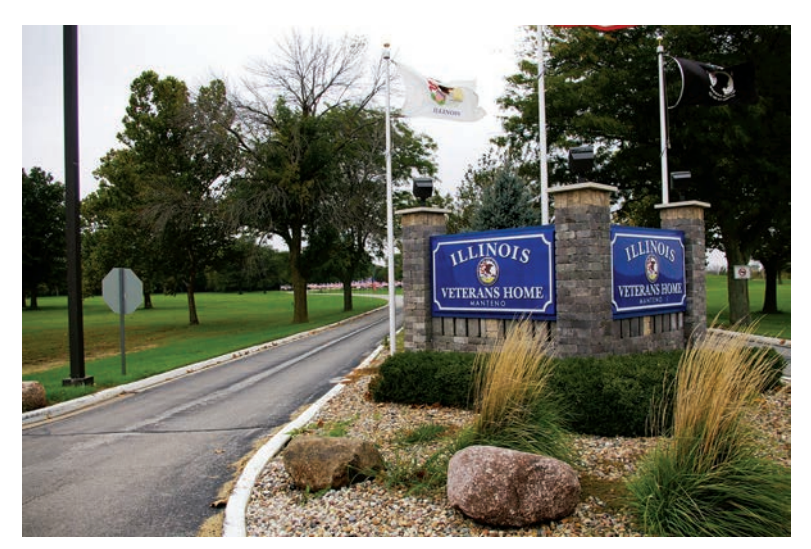
Illinois Veterans Home in Manteno

The Illinois Veterans' Home at Manteno (IVH-M), celebrated its 32nd year of service in April and continues to serve many northern and central Illinois veterans. The IVH-M is located on 122-acre campus 60 miles south of Chicago; approximately 143 acres of additional property is farmed with the proceeds of that lease being placed in the Manteno Home Fund. The Home provides a comfortable residence for the veterans in a peaceful rural setting and has a post office, library, bank, beauty/barber shop, and commissary which services up to 294 residents. The campus features a 1½ acre man-made pond that is stocked and landscaped, with a pavilion where veterans can enjoy the outdoors and "catch-and-release" fishing.