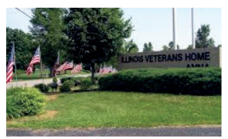
Illinois Veterans' Home in Anna

The Illinois Veterans' Home at Anna (IVH-Anna) is a 50-bed, skilled care nursing facility with six adjoining domiciliary units for 12 residents. Situated on a 16.1-acre site in Union County, the Home provides long-term skilled nursing care services, rehabilitative, and social services.