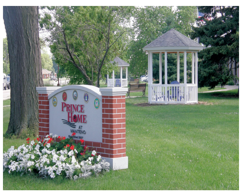
Prince Home for homeless and disabled veterans

Located on the grounds of the Manteno Veterans' Home, the Prince Home for homeless and disabled veterans is a separate program with a dedicated staff and program director. The Prince Home opened in 2007 to provide permanent supportive housing for men and women veterans in its 15-bed facility.