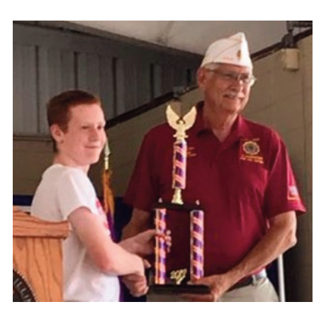
Aug 11, 2019, Illinois State Fair – members of the Illinois Army National Guard Recruiting & Retention Battalion awarded Junior Reserve Officers' Training Corps (JROTC) drill teams first, second and third prizes along with monetary gifts.