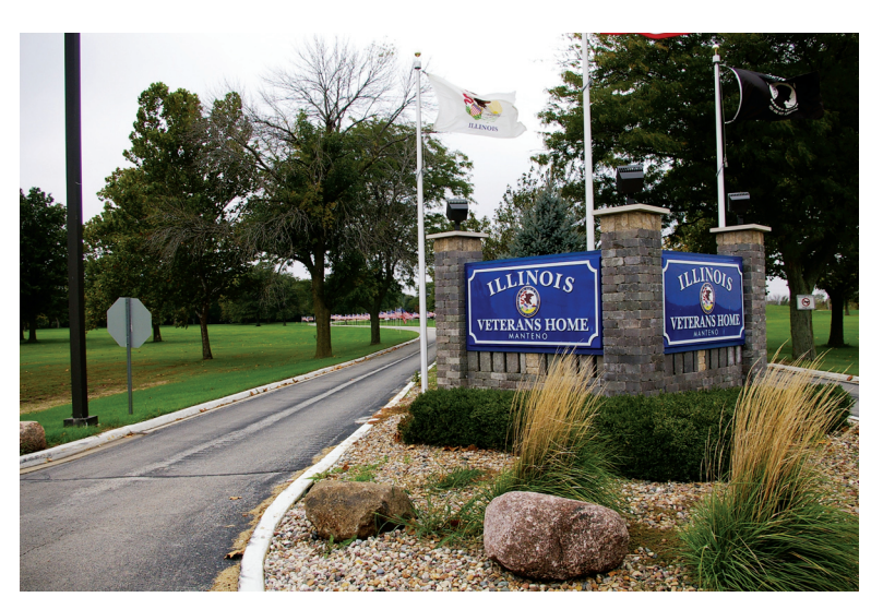
Illinois Veterans Home in Manteno

The Illinois Veterans' Home at Manteno (IVH-M), celebrated its 32nd year of service in April and continues to serve many northern and central Illinois veterans. The IVH-M is located on 122-acre campus 60 miles south of Chicago; approximately 143 acres of additional property is farmed with the proceeds of that lease being placed in the Manteno Home Fund. The Home provides a comfortable residence for the veterans in a peaceful rural setting and has a post office, library, bank, beauty/barber shop, and commissary which services up to 294 residents. The campus features a 1½ acre man-made pond that is stocked and landscaped, with a pavilion where veterans can enjoy the outdoors and "catch-and-release" fishing.