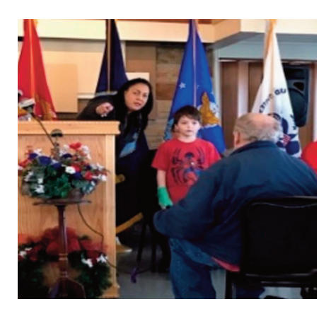
Pearl Harbor Remembrance Day at Springfield Elks Lodge #158