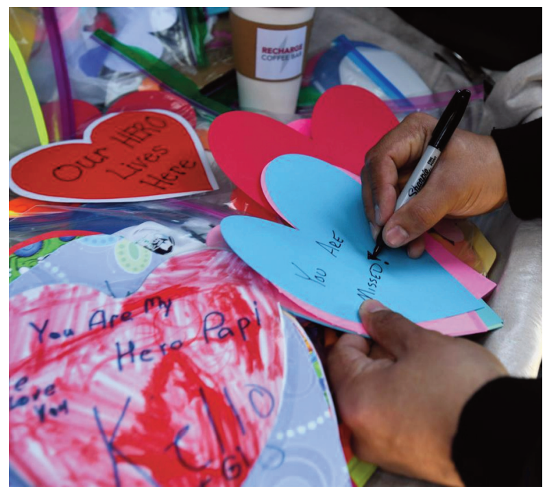
Figure 2-Operation Rising Spirit continues to boost spirits of our veterans and staff during COVID-19.